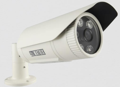
SATATYA CIBR20FL36CWS 2MP IR Bullet Camera with 3.6mm Lens

Matrix project series IP Cameras are built using superior components such as Sony STARVIS sensor and higher MTF lens to offer unmatched image quality especially during the low light conditions. Powered by True WDR algorithm, these cameras offer consistent image quality even in highly varying lighting conditions. Built in intelligent analytics including Intrusion Detection, Trip Wire, etc. ensure real-time security. Moreover, H.265 compression and Automatic Motion based Frame Rate Reduction save bandwidth and storage up to 50%.