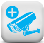
SONY STARVIS SENSOR