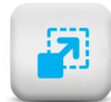
HIGHER FIELD OF VIEW