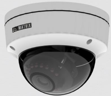
SATATYA MIDR20FL36CWS 2MP IR Dome Camera with 3.6mm Lens

Matrix project series IP Cameras are built using superior components such as Sony STARVIS sensor and higher MTF lens to offer unmatched image quality especially during the low light conditions. Powered by True WDR algorithm, these cameras offer consistent image quality even in highly varying lighting conditions. Built in intelligent analytics including Intrusion Detection, Trip Wire, etc. ensure real-time security. Moreover, H.265 compression and Automatic Motion based Frame Rate Reduction save bandwidth and storage up to 50%.